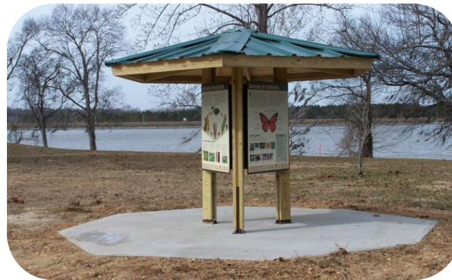
William Dannelly Reservoir