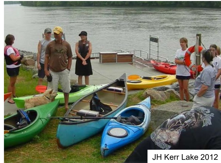
JH Kerr Lake 2012